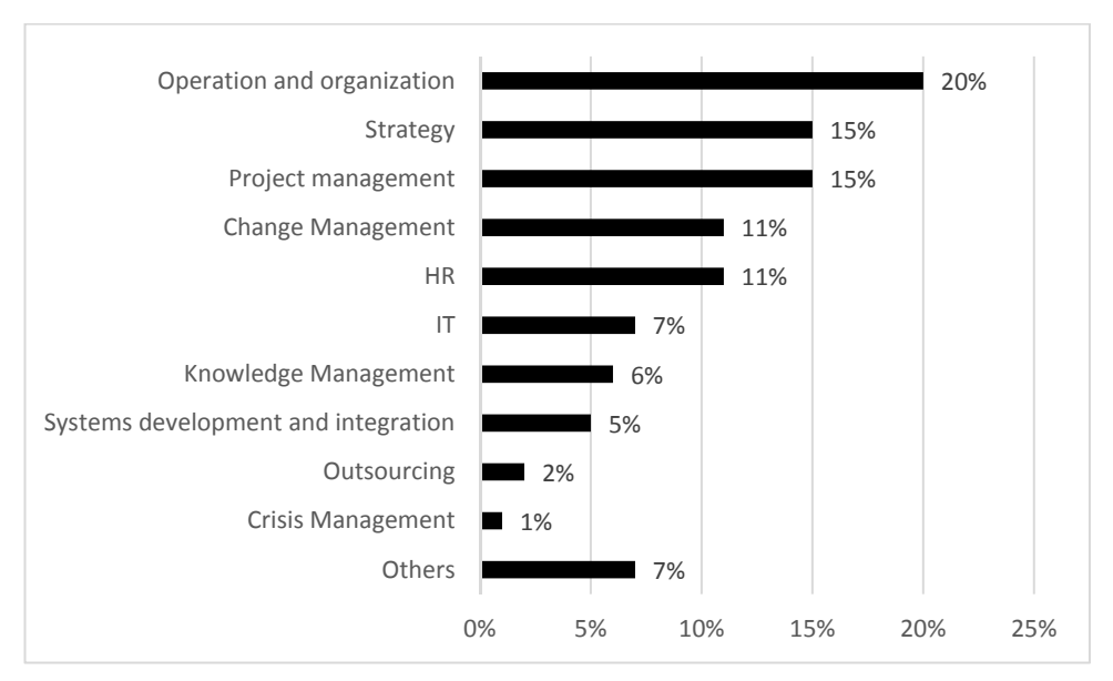
Figure 3 Most common business consulting activities in Hungary in 2015

Based on the survey, strategic consulting includes development of strategic planning, mergers, acquisitions, sales and marketing, so overall strategic management.