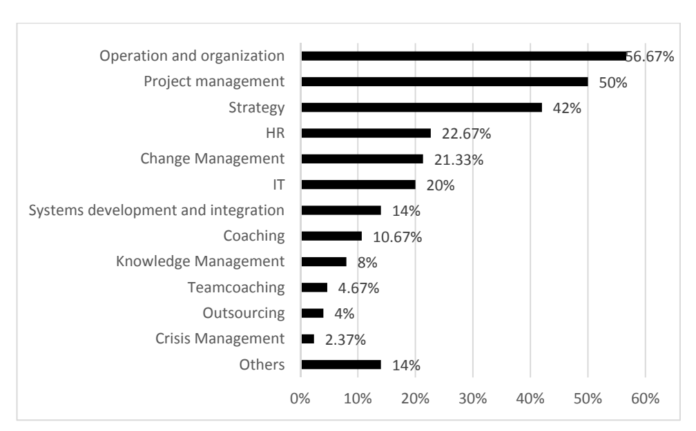
Figure 2 Most common business consulting activities in Hungary in 2014

This survey indicates that the most common operations in Hungary after the financial crisis was to start new activities and the second most common activity was to redefine the strategy of the company (Poór, 2014). Participating companies in the survey were asked about which consultancy field is increasing or decreasing by their own estimations. The use of the consulting services show that strategic management and HR consulting activities declined mostly. This probably indicates that the market of these consulting services became saturated.