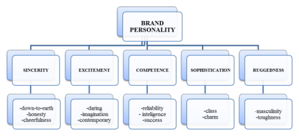
Figure 2 Brand Personality Dimensions Source: Adopted by Aaker, 1997, pp. 347-356

The brand's personality construct is understood as a form of attributing the character of the brand's human character in order to achieve distinctiveness. Such a brand dehumanization construct approaches consumer perceptions, associations and impressions according to brands. The brand's personality is based on the hypothesis the consumer is perceived by personification of human traits as shown in Figure 2. The brand's personality is perceived as a multidimensional construct expressed through consumer's emotional attributes and is most often represented through five dimensions: honesty, excitement, ability, refinement and ugliness. Each dimension consists of facets that represent the character of the dimension as illustrated in Figure 2.